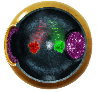
Fig. 2 Artistic description of a nanoscale reaction chamber for single molecule analysis, which is a possible future application of the macromolecular gates.

All interested colleagues are welcome to this seminar lecture (45 min. presentation followed by discussion).